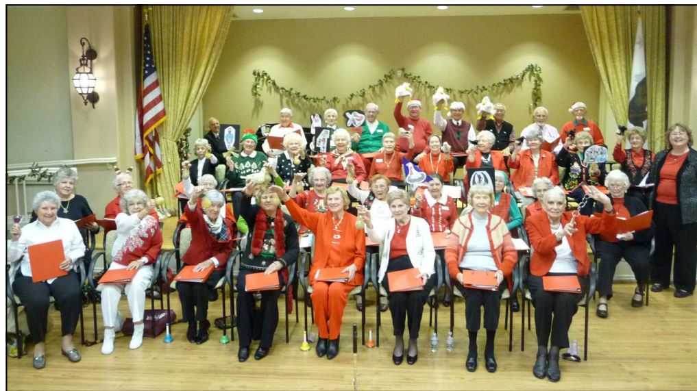
The entire 36-member Glenaires Choir performed a wonderful Holiday concert in Catalina Hall on Dec. 13 with contemporary as well as traditional songs, such as "The Twelve Days of Christmas" complete with props, as shown above.